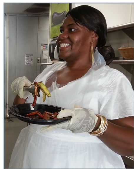
Learning how to cook up a healthy storm.